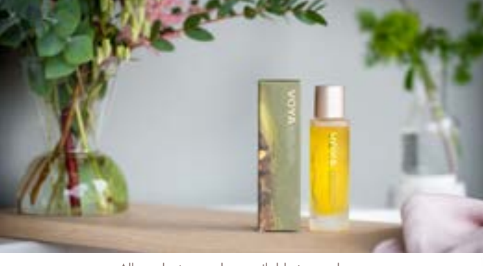
All products are also available to purchase.

As the leading expert in harnessing the endless restorative and healing powers of seaweed, this Irish product is 100% certified organic therapy. Unwind with a body therapy, pamper yourself with a treatment.