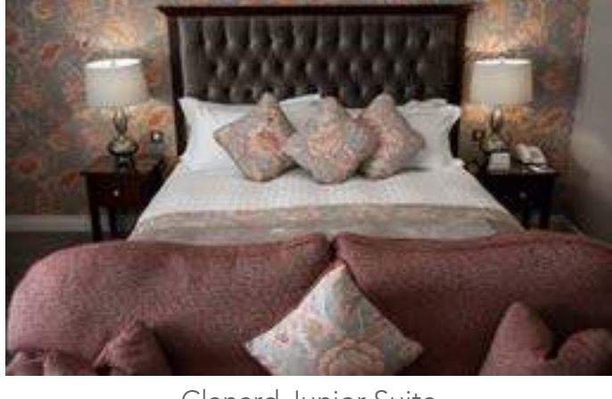
Clanard Junior Suite