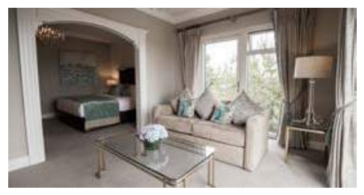
Our Civil Ceremony Rooms

Chose from our gorgeous Garden Suite with its own private terrace and free-standing luxurious bath tub (in the room!) or our top Retreat Suite with its own balcony, fireplace and floor to ceiling window views of our surrounding rolling countryside. Upgrade + €150